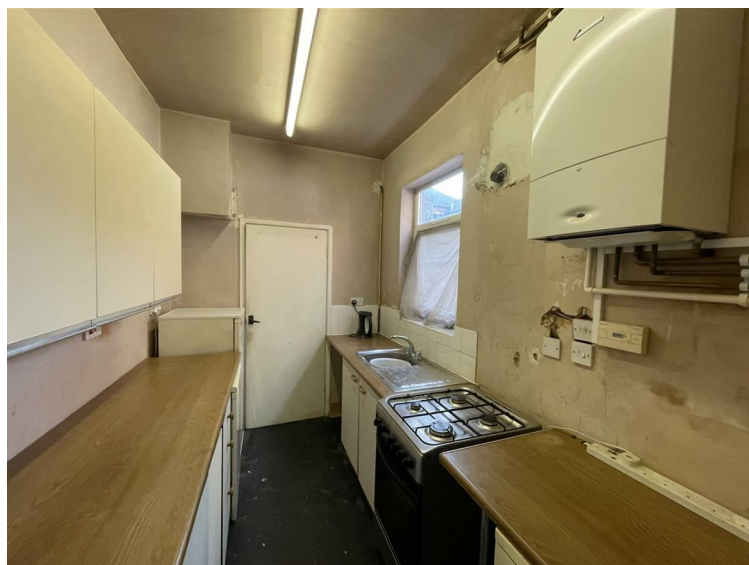
KITCHEN 10'0" x 6'5" (3.05 x 1.96)

Double glazed front door, meter cupboard, coving, stripped floors, radiator, door leading into,