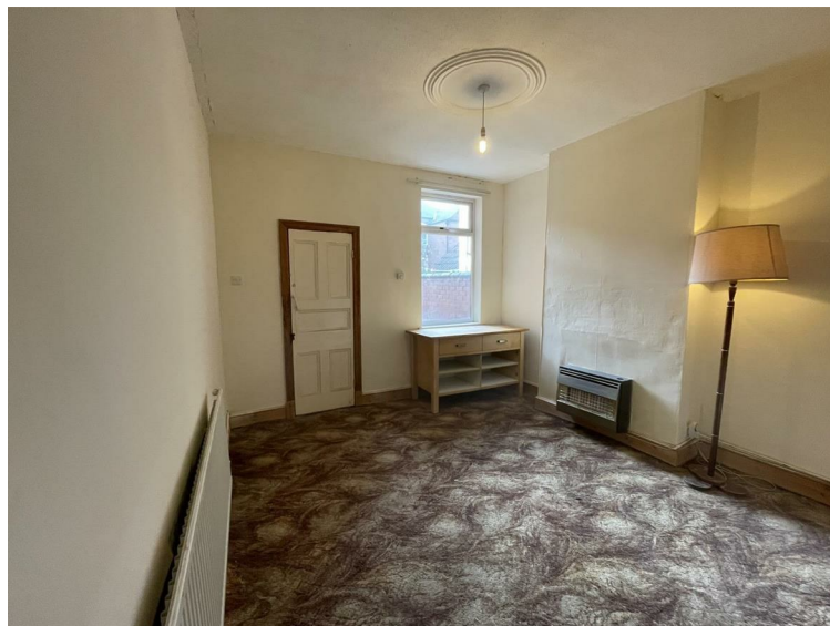
RECEPTION TWO 14'11" x 11'8" (4.57 x 3.56)

VIEWING IS RECOMMENDED - CALL BARKERS NOW ON 0116 2709394