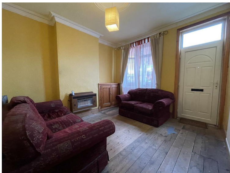
RECEPTION ONE 13'2" to bay x 11'7" (4.02 to bay x 3.55)

Radiator, double glazed window to rear aspect, door leading into,